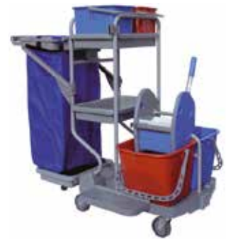
Polypropylene multi-purpose service trolley ACE 7