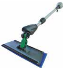
CLEANO indoor glass cleaning tool with telescopic handle