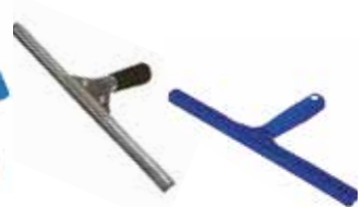
Stainless steel window squeegee