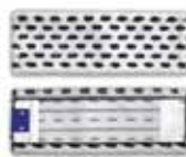
Spot microfiber No Touch mop replacement