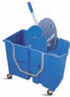
Polypropylene double section bucket trolley CLEVVY 30 30 Ltrs.