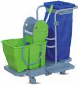
Polypropylene multi-purpose service trolley WOW 4