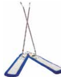
V sweeper complete