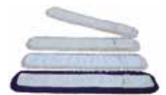
V sweeper mop replacement