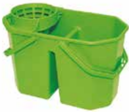
Double mop bucket 15 Ltrs.