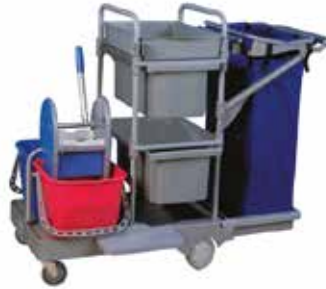
Polypropylene multi-purpose service trolley ACE 77L