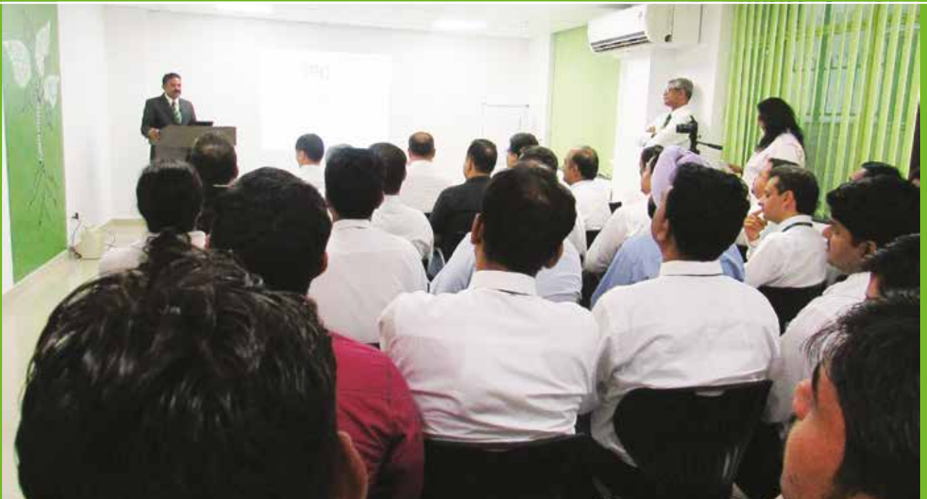
IPC Training Centre, New Delhi

& sustainable service support network and through our motivated & proficient people. We have also opened a training academy at our Head office to impart training on general cleaning, on Cleaning Mechanization & to extend specific training on our range of machines to our sales & service staff & to the house keepers & machine operators of our valued patrons.