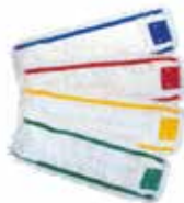
Loop microfiber No Touch mop replacement