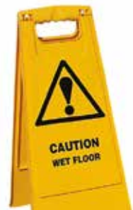
Wet floor sign