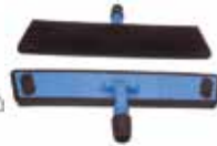
Evowell lamellar rubber frame