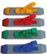
Polypropylene No-Touch Frame