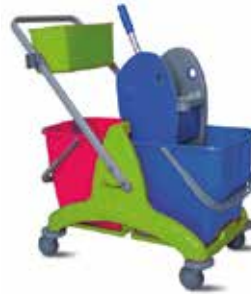
Double bucket trolley TRISTAR 30/50 Ltrs.