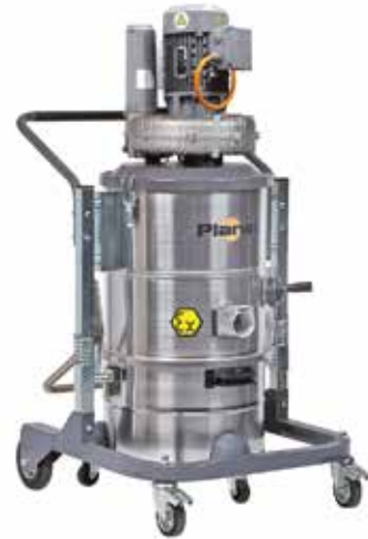
PLANET 152 ATEX