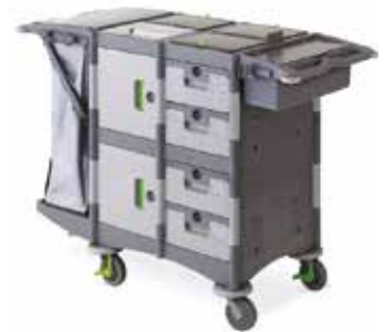
BRIX Trolley / Hospital