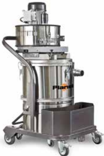
PLANET OPTIM ATEX