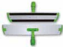
Aluminium holder with Velcro and universal joint