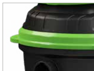
SIDE PROTECTION AGAINST DOORS AND WALLS