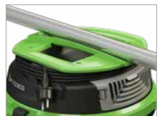
ERGONOMIC HANDLE WITH INTEGRATED CABLE WRAP