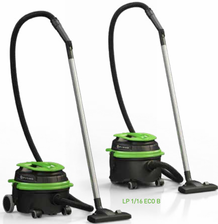
LP 1/12 ECO B LP 1/12 HEPA UP